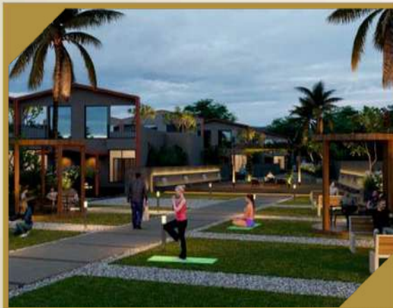
Senior Citizen Park