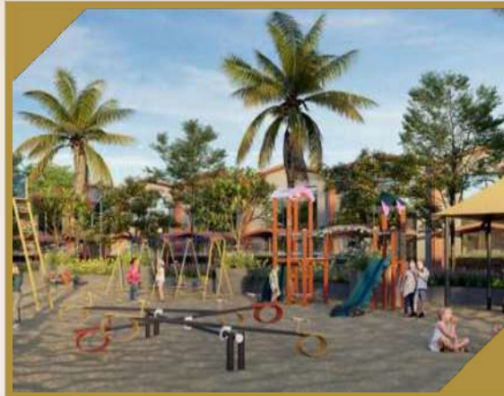
Children Play Area