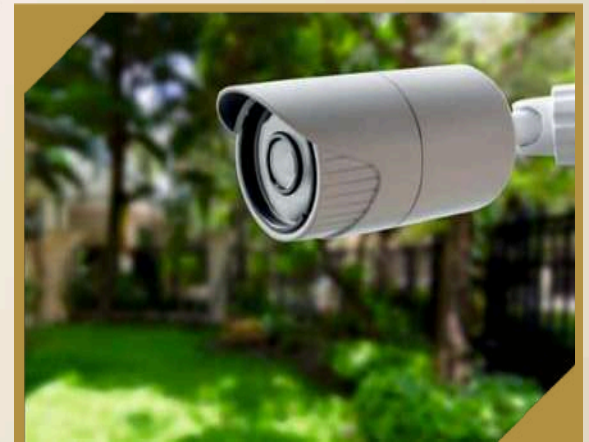
CCTV Surveillance System